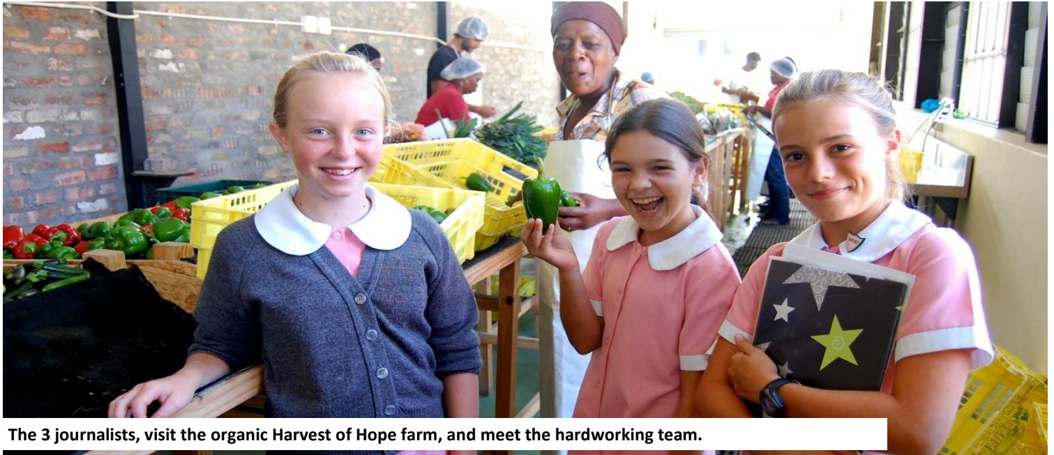
The 3 journalists, visit the organic Harvest of Hope farm, and meet the hardworking team.