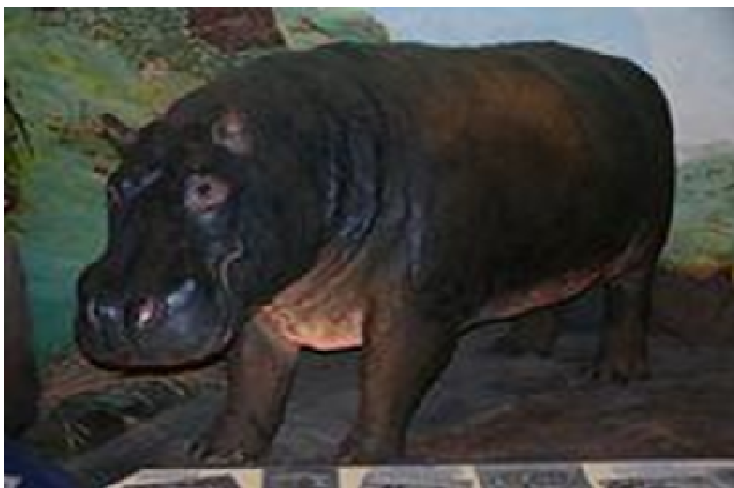
ABOVE: The body of Huberta is now on display in the Amathole Museum in South Africa

Four farmers unfortunately shot her dead as she crossed a river. This caused such a public outcry that it was even discussed in Parliament and the Police opened an inquest. The four farmers. They were fined R500 (which was plenty in the 1930's).