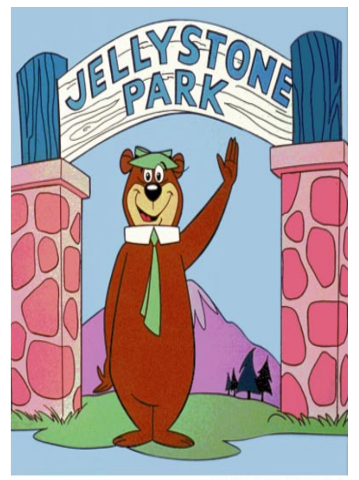
Hey There, It's a Yogi-Bear-A-Thon!