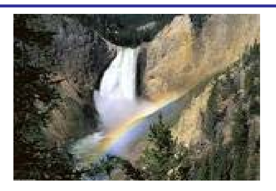
Yellowstone National Park

I have visited Yellowstone National Park when I was very little. I remember many parts of that trip including, watching old faithful, seeing my first bison, and watching a bald eagle feed her babies. I would really like to go to Glacier National Park, because it would be a very good experience.