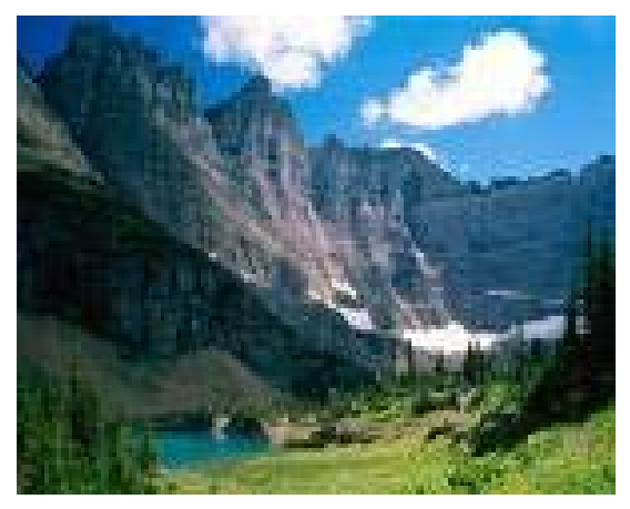
Glacier National Parks