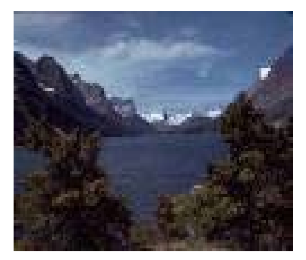
Glacier National Park